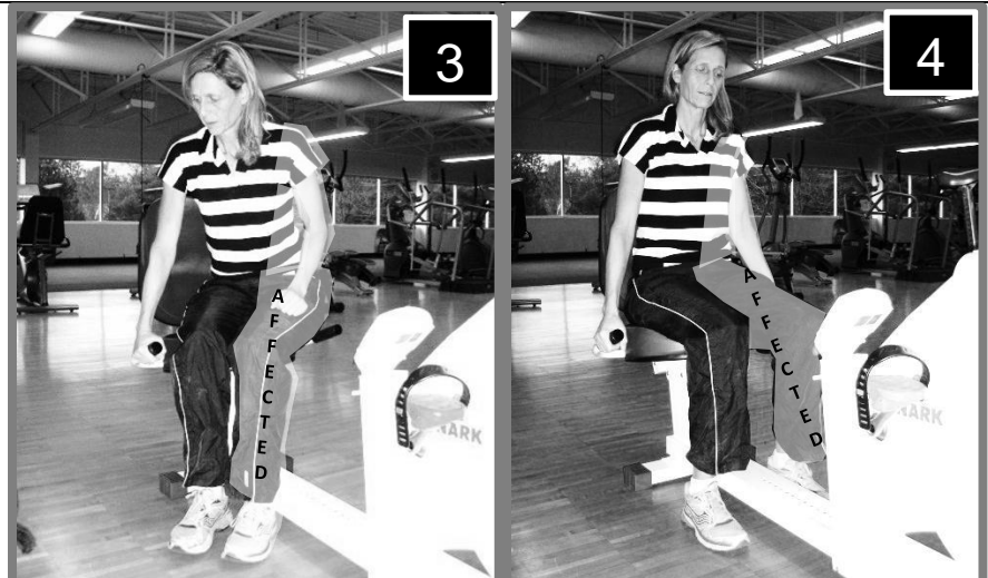
Figure 3. Once seated, lift your affected leg over the crossbar and to the other side.

Figure 4. With assistance, place your feet into the pedals.